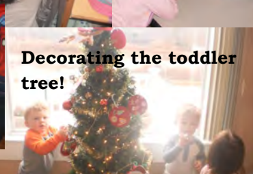
Decorating the toddler tree!