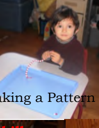
Making a Pattern