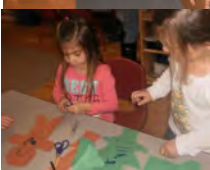
Fine motor skills